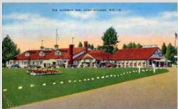
(Old Gateway Postcard)